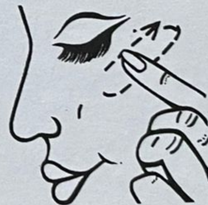
...for cosmetic finishing